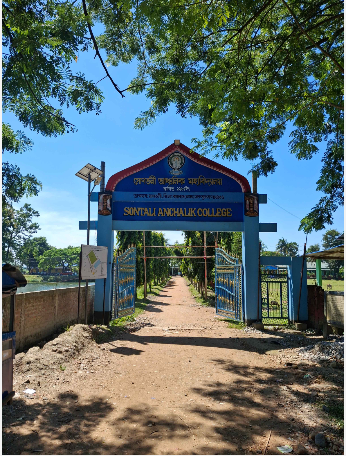
College Main Gate