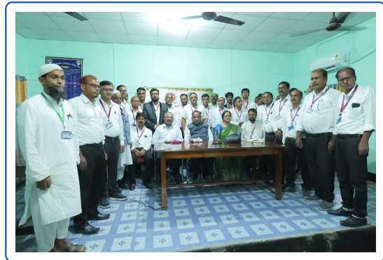
(f) Exit Meeting