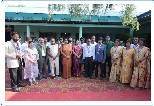
(a) Group photo with NAAC Peer Team