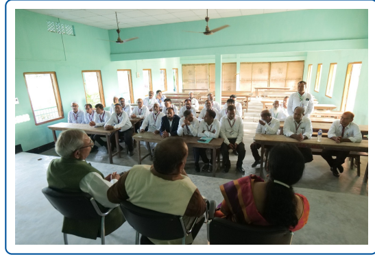
(d) Interaction with NAAC Peer Team and Staff