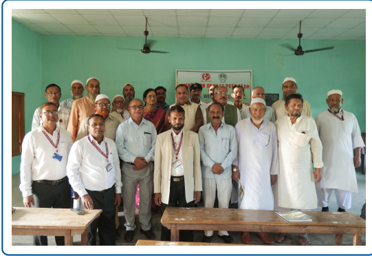
(c) Group photo with NAAC Peer Team and Guardian