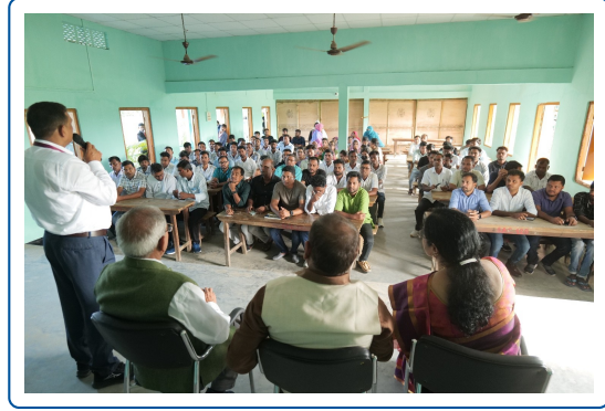
(b) Interaction with NAAC Peer Team and Alumni