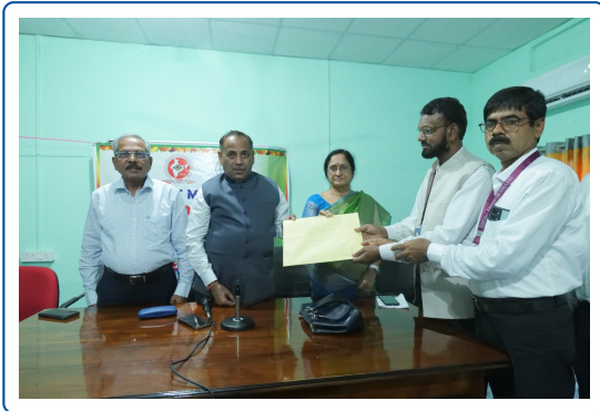
(e) Peer team report handover by NAAC Peer Team