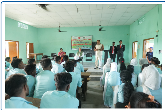
(g) Interaction with NAAC Peer Team and Students